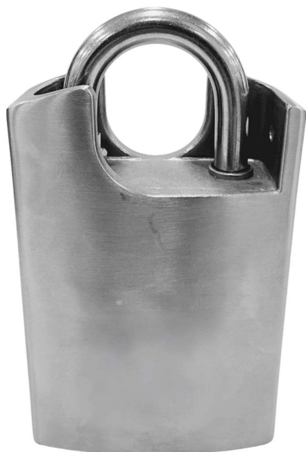
Back Side – Single-sided Anti-Cutting shield